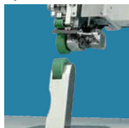
Standard In Line Pedestal